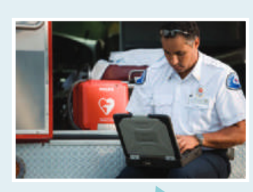
Provide timely feedback

Patient data flows according to your desired workflow using your existing infrastructure